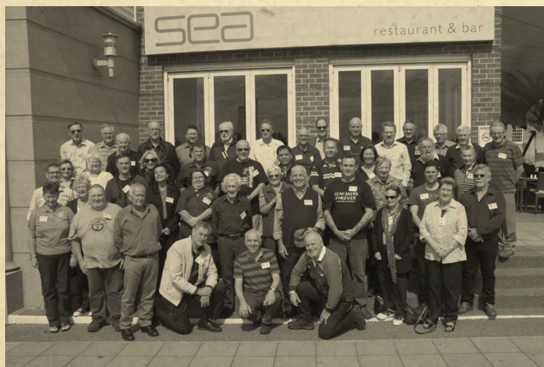
MTS NATIONAL CONFERENCE - NEWCASTLE