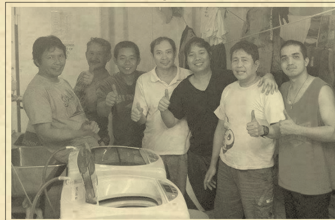
FROM M/V CAP PASADO CREW. THANK YOU TO MISSION TO SEAFARERS MELBOURNE. FINALLY WE HAVE WASHING MACHINES.

"Thank you to Mission to Seafarers in Melbourne. Finally we have washing machines."